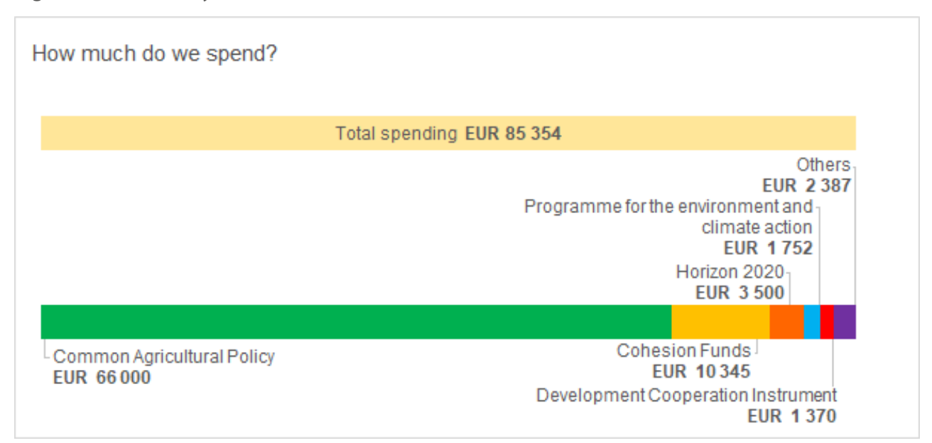
Figure 3: Biodiversity contribution in 2014 to 2020 (million EUR)