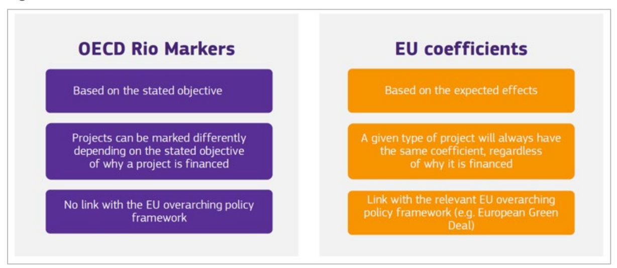
Figure 2: OECD Rio markers versus EU coefficients

Source: European Commission (2021) The Performance Framework for the EU Budget under the 2021-2027 Multiannual Financial Framework – Volume 1', COM(2021) 366 final, 8 June 2021.